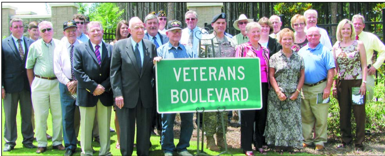
Dignitaries, local officials, veterans and citizens gather in honor of renaming Hwy. 301 as Veterans Boulevard