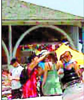
Miley (in the green dress) gets her hair and makeup touched up between scenes

The day's set centered around a volleyball tournament that Miley